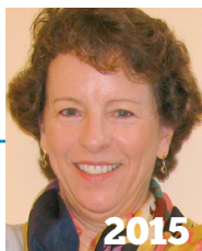
ALP board studies expansion